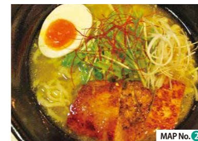
MAP No. 2