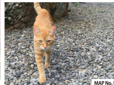
MAP No. 6

Restaurant where you can eat Halal/Muslim Friendly menu