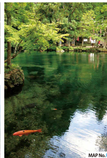
MAP No. 5